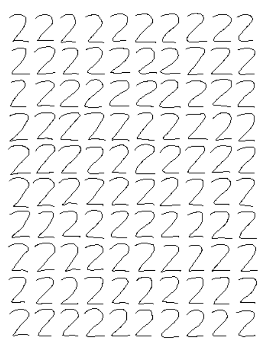
Figure 3. An example training image containing 100 samples of the digit 2.

I used 100 samples of each digit in a 10 x 10 grid, like the one shown in Figure 3. Each image is processed separately and used in its own classifier as the knowledge base.